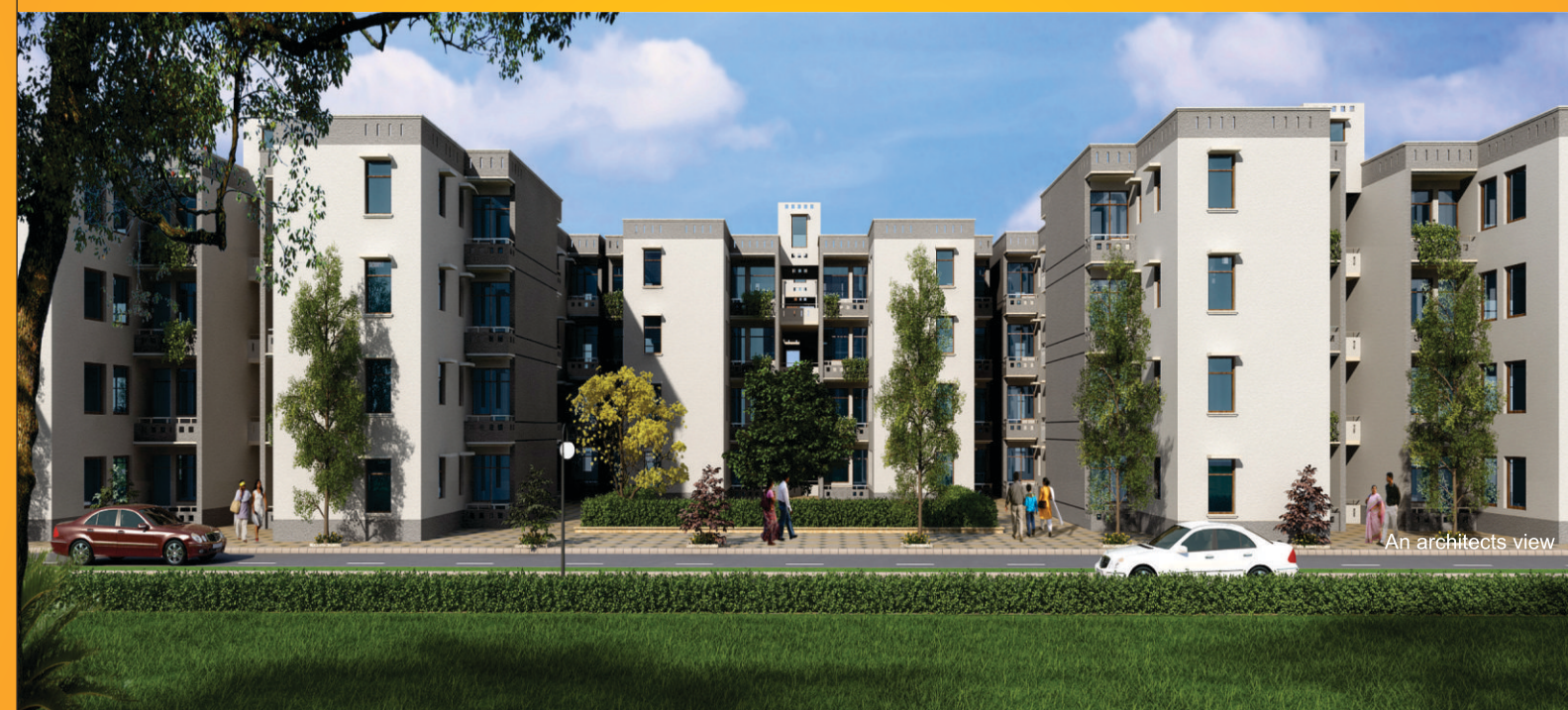
An architects view

An exclusive range of affordable 3BHK Apartments