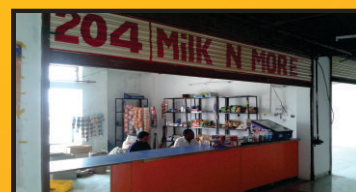
MILK AND MORE