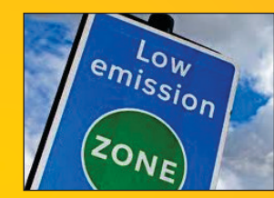
Low pollution level