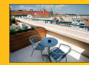
Private balconies in each apartment