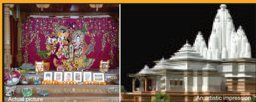
ANSAL ISKCON Spiritual Centre (Operational)