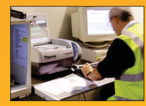
Absolutely secure with regulated entry and exit points