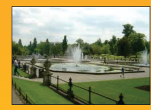
Ample open areas