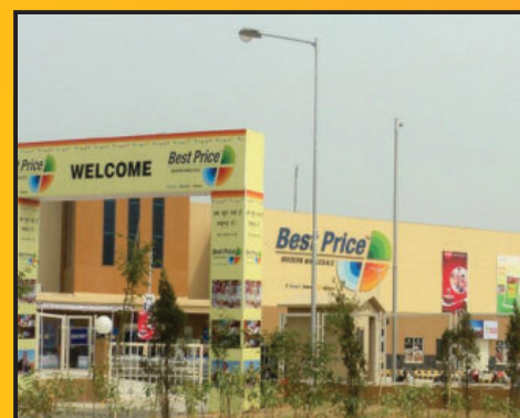
Best Price - Joint venture between Bharti & Walmart (Operational)