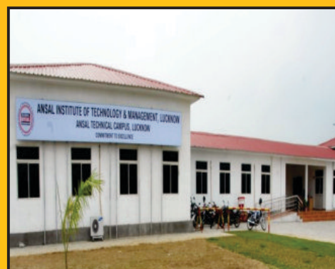
Ansal Institute of Technology & Management (AITM) (Operational)