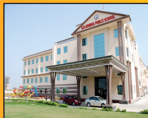
G.D. Goenka Public School Academic session started