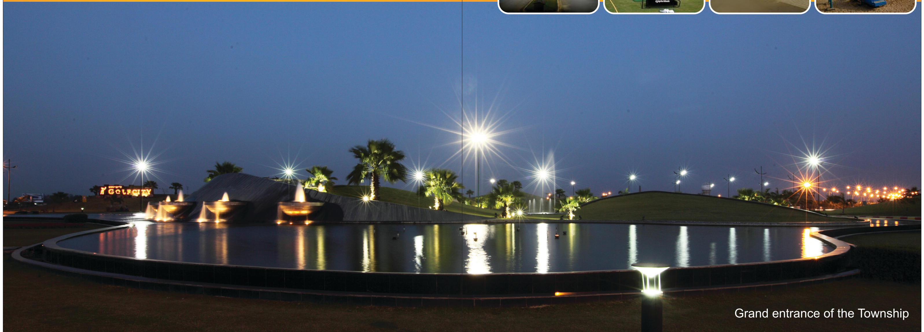
Grand entrance of the Township